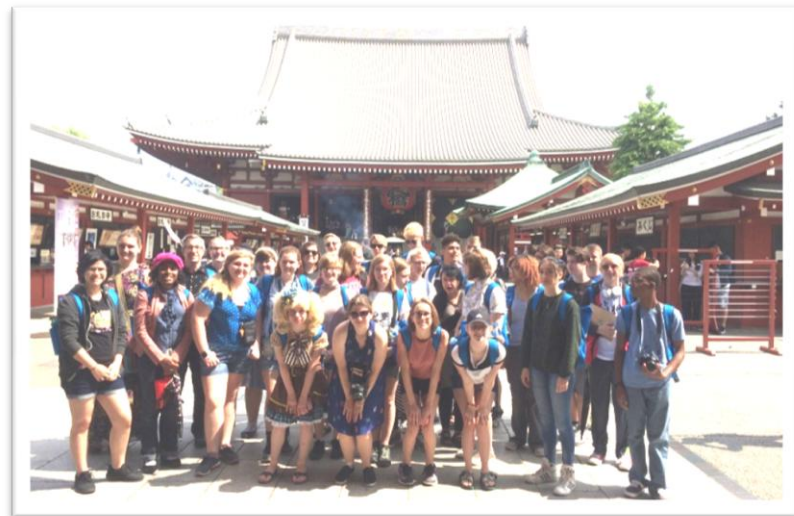
Travelers from the Land of the Rising Sun Tour 2017